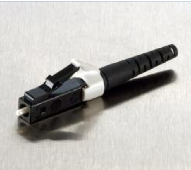
Heat-Cure LC Connector | Photo LAN751