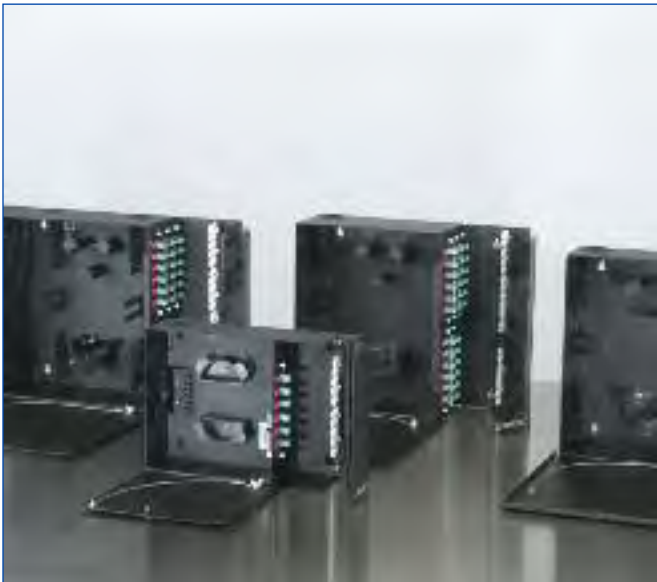
Wall-Mountable Connector Housings | Photo LAN703

Corning Cable Systems Wall-Mountable Connector Housing (WCH) provides interconnect or cross-connect capabilities between the outside plant, riser or distribution cables and the opto-electronics. Available in two, four, six and 12 panels, the rugged metal housings can be wall-mounted in main cross-connections or telecommunication rooms. Units accept standard closet connector housing (CCH) connector panels and modules and options include jumper routing guides and a bracket for securing buffer tube fan-out kits. The cable strain-relief kit (WCH-STRNRLF-KIT) is designed for easier installation and the standoff bracket (WCH-STDOFF-BKT) extends the WCH from the wall to allow cable routing behind the housing. Brackets can also be stacked to increase the amount of space for routing. An optional field-installable lock kit is available for additional security.