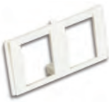
MX-SMB-MM-(XX) . . . . . 2-port multimedia bezel