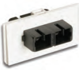
MX-SMB-SC-(XX) . . . . . 2-port bezel with one duplex SC adapter*