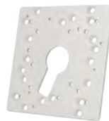
AV-EBA Electrical Box Adapter