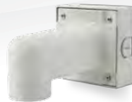
AV-WMJB Wall Mount Bracket with Junction Box (Fit 1.5" NPT)