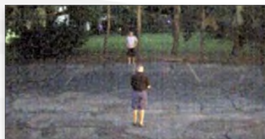
Color image with STELLAR at 0.02 Lux