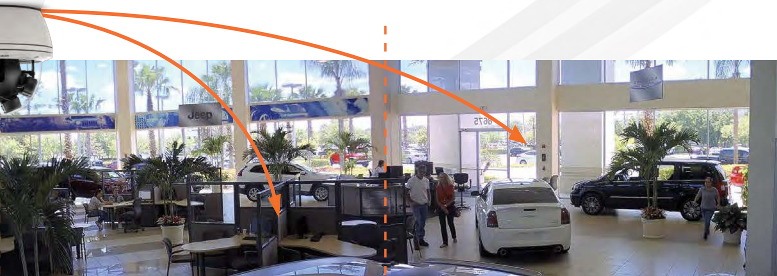
Camera Zone 3*