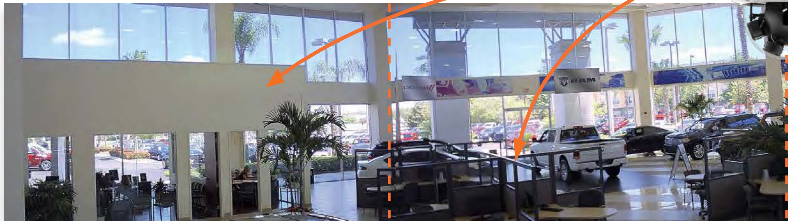
Camera Zone 1*