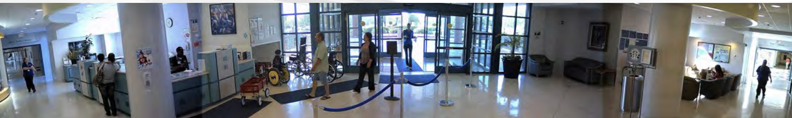
Stitched image from an 8MP SurroundVideo 180° camera in a healthcare services environment