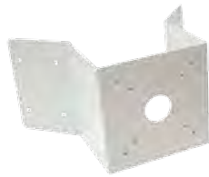
AV-CRMA Corner Mount Adapter