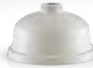
SV-CAP Wall Mount Cap Only with 1.5" NPT