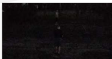
Color image without STELLAR at 0.02 Lux

Advanced Low-Light Technology for Noise Reduction and Enhanced Color Imaging in Near Complete Darkness. STELLAR technology is "Spatio Temporal Low Light Architecture" which allows for color imaging in near complete darkness. Arecont Vision STELLAR technology utilizes a patented algorithm that reduces noise, motion blur, bit rate, and storage requirements. STELLAR has superior low light sensitivity, making it capable of covering areas where very little light is present.