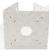
AV-PMA Pole Mount Adapter