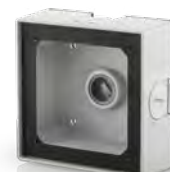
AV-JBA Junction Box Adapter (Fit 3/4" NPT Conduit)