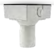
AV-PMJB Pendant Mount Bracket with Junction Box (Fit 1.5" NPT)