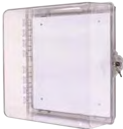
STI-7530 with Key Lock