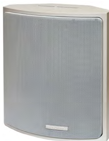
NQ-S1810WT Wall Baffle VoIP Speaker