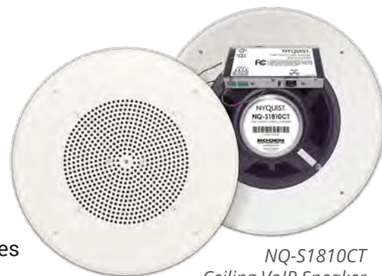
NQ-S1810CT Ceiling VoIP Speaker